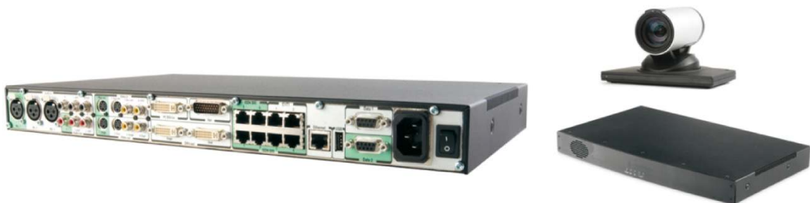
A 6000 MXP Integrator Package is available and provides all the necessary components needed to simplify integration